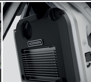
Smart Controlling Unit