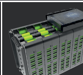
Lithium Ion Battery