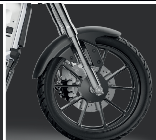
CBS Braking System