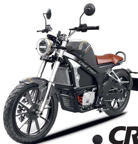
● CR6 Pro