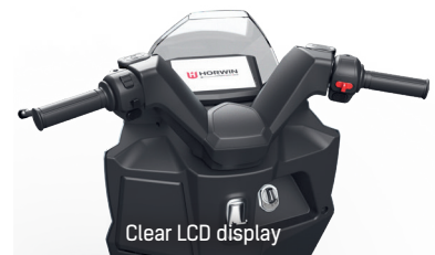
Clear LCD display

FULL LED-LIGHT HELMET STORAGE COMPARTMENT UNDER THE SEAT OPTIONALLY SECOND BATTERY TO DOUBLE RANGE (160 km)